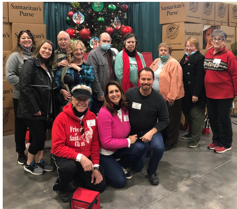
Thank you Calvary team that went to Boone to volunteer at the Samaritans Purse Shoe Box Ministry.